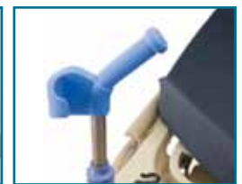
Ergonomic Push Handles