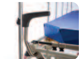
Integrated IV Pole Transport Device