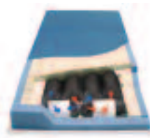
5-inch Air Mattress (PrimeAire® ARS mattress)