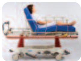
Auto Contour™ option with BackSaver Fowler™ feature