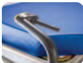
Active Hand Brake

Hill-Rom reserves the right to make changes without notice in design, specifications and models. The only warranty Hill-Rom makes is the express written warranty extended on the sale or rental of its products. © 2006 Hill-Rom Services, Inc. ALL RIGHTS RESERVED. 145647 12/21/06